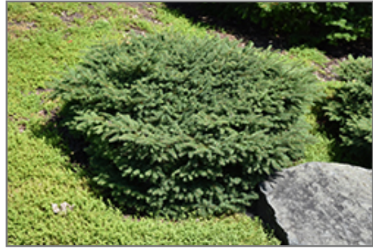
Birds Nest Spruce