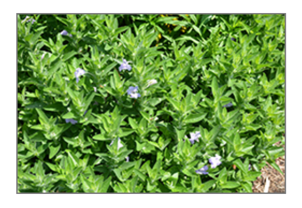
Hairy Wild Petunia in bloom

This plant will require occasional maintenance and upkeep, and is best cleaned up in early spring before it resumes active growth for the season. It is a good choice for attracting bees and butterflies to your yard. Gardeners should be aware of the following characteristic(s) that may warrant special consideration;