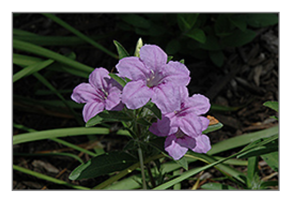
Hairy Wild Petunia flowers

Hairy Wild Petunia is an herbaceous perennial with a mounded form. Its medium texture blends into the garden, but can always be balanced by a couple of finer or coarser plants for an effective composition.