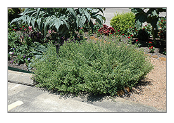
Mexican Oregano

Mexican Oregano is a multi-stemmed deciduous woody herb with a more or less rounded form. Its average texture blends into the landscape, but can be balanced by one or two finer or coarser trees or shrubs for an effective composition.