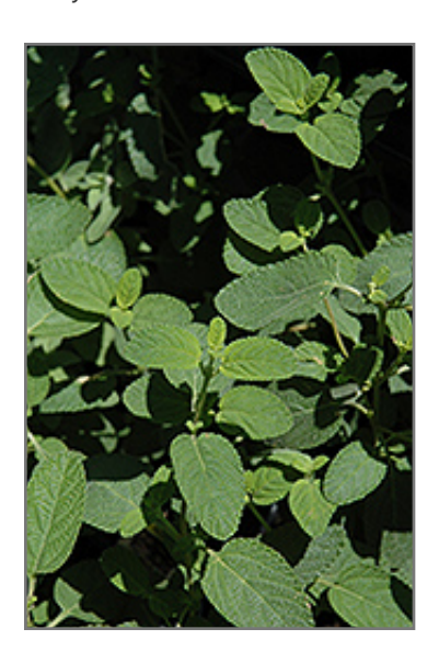
Mexican Oregano foliage

This woody herb will require occasional maintenance and upkeep, and should only be pruned after flowering to avoid removing any of the current season's flowers. Deer don't particularly care for this plant and will usually leave it alone in favor of tastier treats. It has no significant negative characteristics.