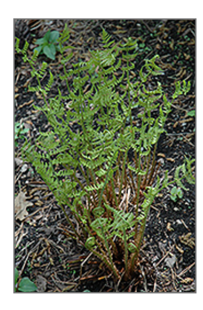
Marginal Wood Fern foliage