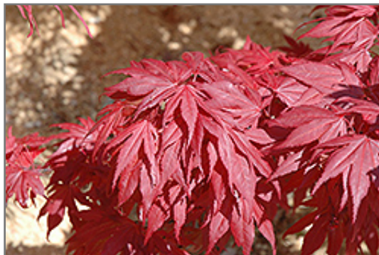
Oregon Sunset Japanese Maple foliage